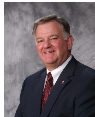
Mayor Glenn Brasseaux

Carencro will begin collecting an extra penny sales tax on October 1, 2009, pursuant to the new I-49 Economic Development District/Tax-Increment Financing District ("TIF") approved by the Carencro City Council. Carencro Mayor Glenn Brasseaux estimates that the extra one-cent tax will generate between $700,000.00 and $800,000.00 annually. Monies collected will be held in trust for road, sewer and other infrastructure projects within the taxing district, which extends along a two mile area of the I-49 corridor in Carencro, and sections of Gloria Switch Road and Veteran's Drive. By adopting this TIF, Carencro will be able to upgrade the services it offers to residents and visitors alike, and utilize existing funds for other much-needed improvements throughout its jurisdiction.